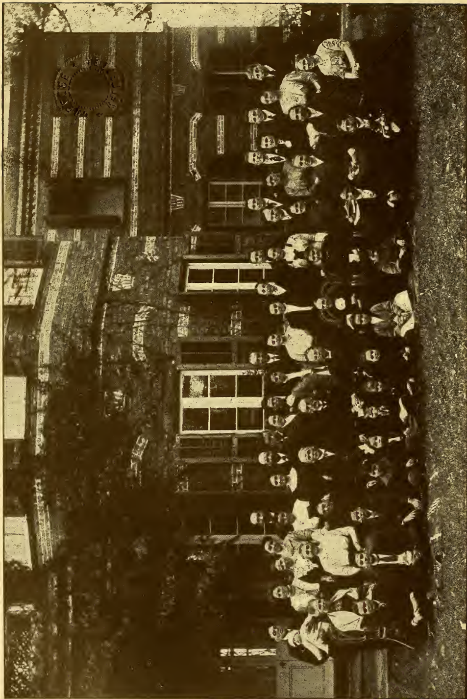
MEMBERS OF THE FOOCHOW MISSION AND THEIR FAMILIES